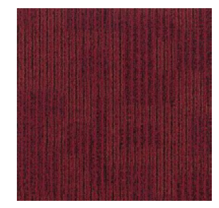
Singapore Plaza LRV – 3.72%