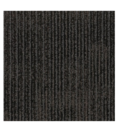
Manhattan Sidewalk LRV – 4.22%