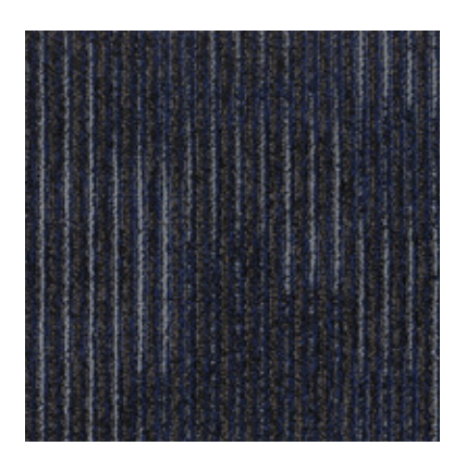
Sydney Harbour LRV – 3.73%